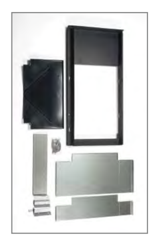
Sleeve Adapter Kit

Vert-I-Pak® is an exact fit for existing First Company SPXR-series single package vertical units when installed with the VPASA1 Sleeve Adapter.